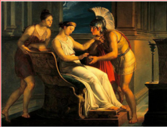
Pelagi, Ariadne giving Theseus a ball of string (1860)

I am going to go through the paintings that you looked at last week and explain what they are showing.