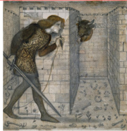
Burne Jones, Theseus and the Minotaur in the Labyrinth (1861)