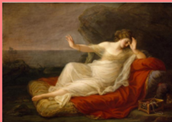
Kauffman, Ariadne Abandoned by Theseus (1774)